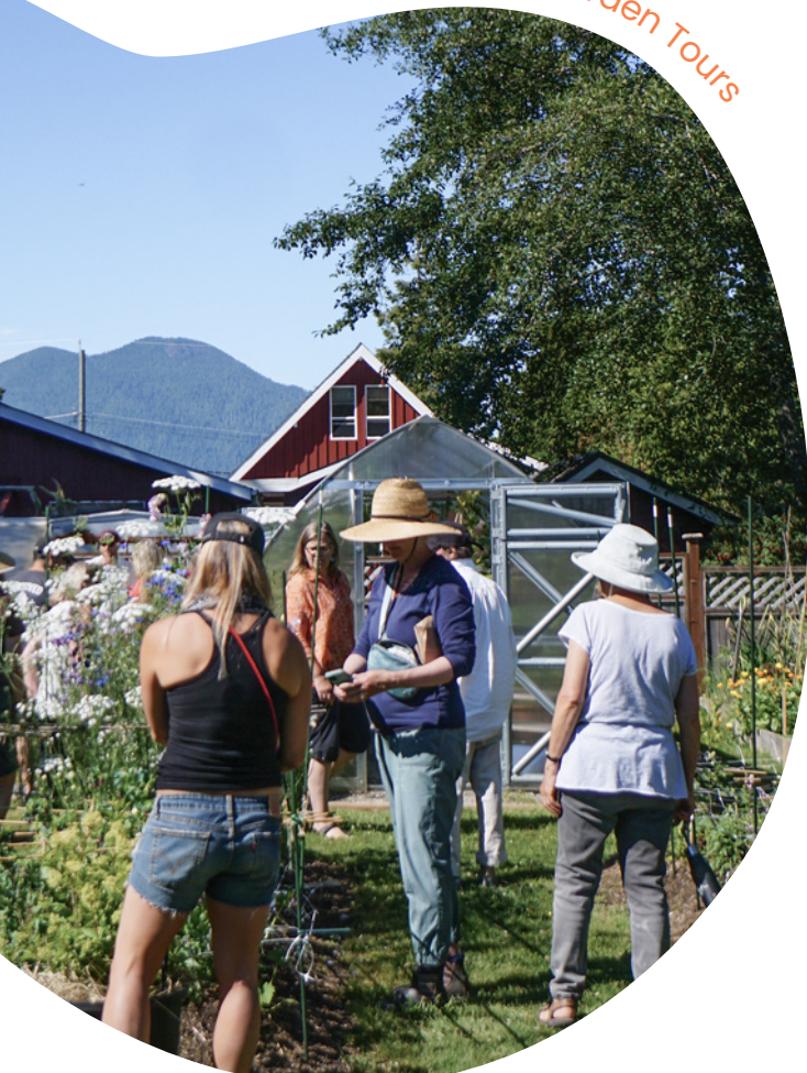
Edible Garden Tours

In 2022, we hosted four successful seasonal events: Seedy Saturday to kick off the growing season, Edible Garden Tours in Tofino & Ucluelet to experience the abundance of mid-summer, and the Harvest Celebration to close out the year. Based on attendance, our garden tour was the most successful in all of the years we have been hosting it, and we were delighted to be able to include Ucluelet gardens in the tour. Thank you to the Wickaninnish Community School for graciously providing a space for community gathering, and to all the gardeners for opening your homes to the tours!